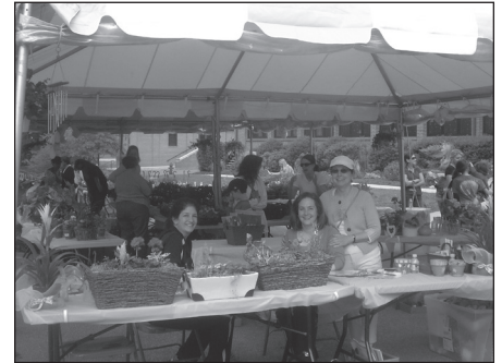
Enjoying good company at the Plant Sale

Sodality ended this 2012/2013 year very, very strong. It has been a fantastic year with many activities that strengthened our commitment to the Blessed Virgin Mary. The St. Jane Sodality is one of the most active ministries in the parish.