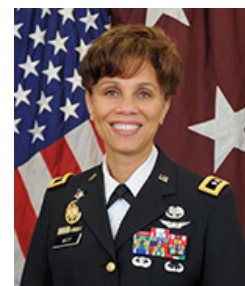
LT. GEN. NADJA Y. WEST Surgeon General of the U.S. Army Commanding General, U.S. Army Medical Command

Cost of the catered breakfast is $30.00 per person. Tickets can be purchased at the door.